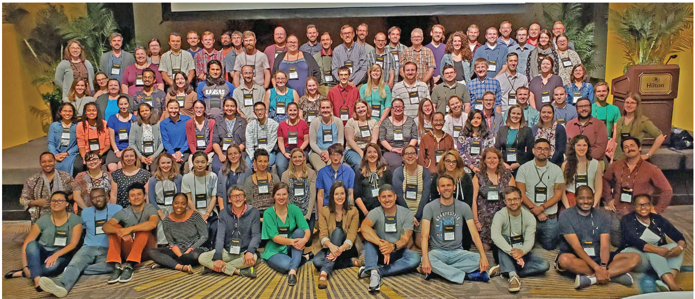
Project NExTers (Silver '19) at MAA MathFest in Cincinnati.

Application deadline: April 15, 2022 projectnext.maa.org • projectnext@maa.org