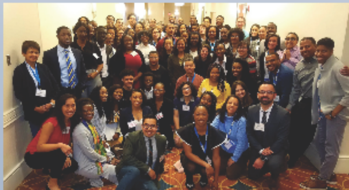
2019 Workshop Attendees

Lunch will be provided for all registered participants. Travel compensation is available. Registration is required for consideration.