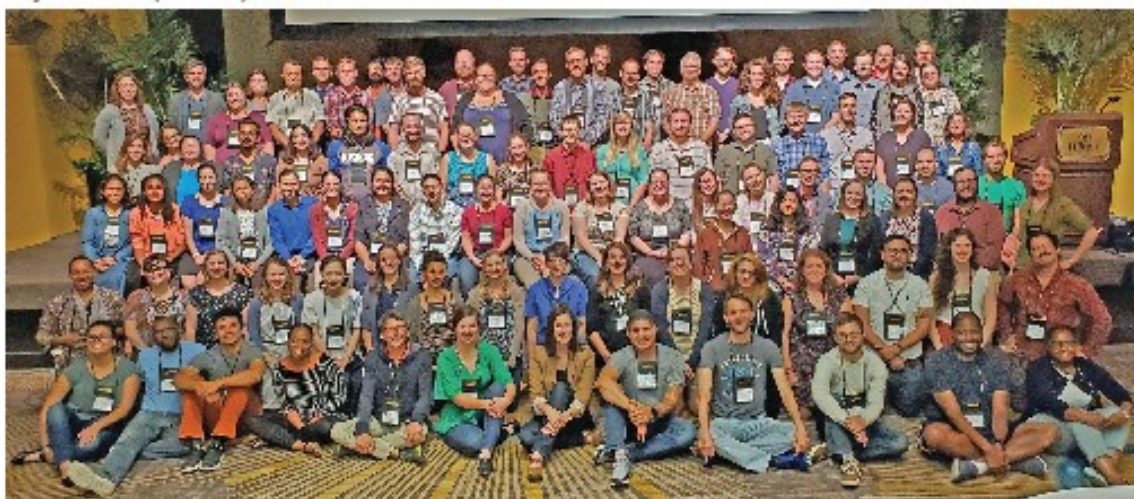
Project NExTers (Silver '19) at MAA MathFest in Cincinnati.

Application deadline: April 15, 2020 projectnext.maa.org • projectnext@maa.org