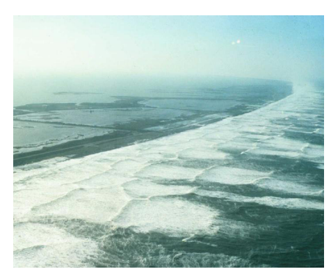
Nonlinear water waves off the coast of North Carolina during the Perfect Storm of 1991, a subject studied using advanced mathematical tools.