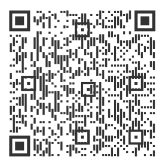
Submit your application

*We encourage applications from women and underrepresented groups in Mathematics.